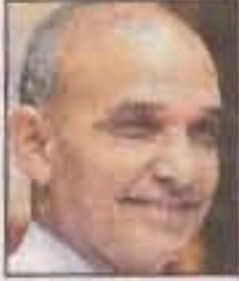
Satyapal Singh | JUNIOR HRD MINISTER

Discrimination between public and private institutions will gradually come to an end since the matter is under serious consideration at the highest level