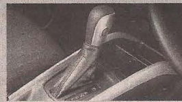
Advanced Automatic Technology, CVT (Continuously Variable Transmission)